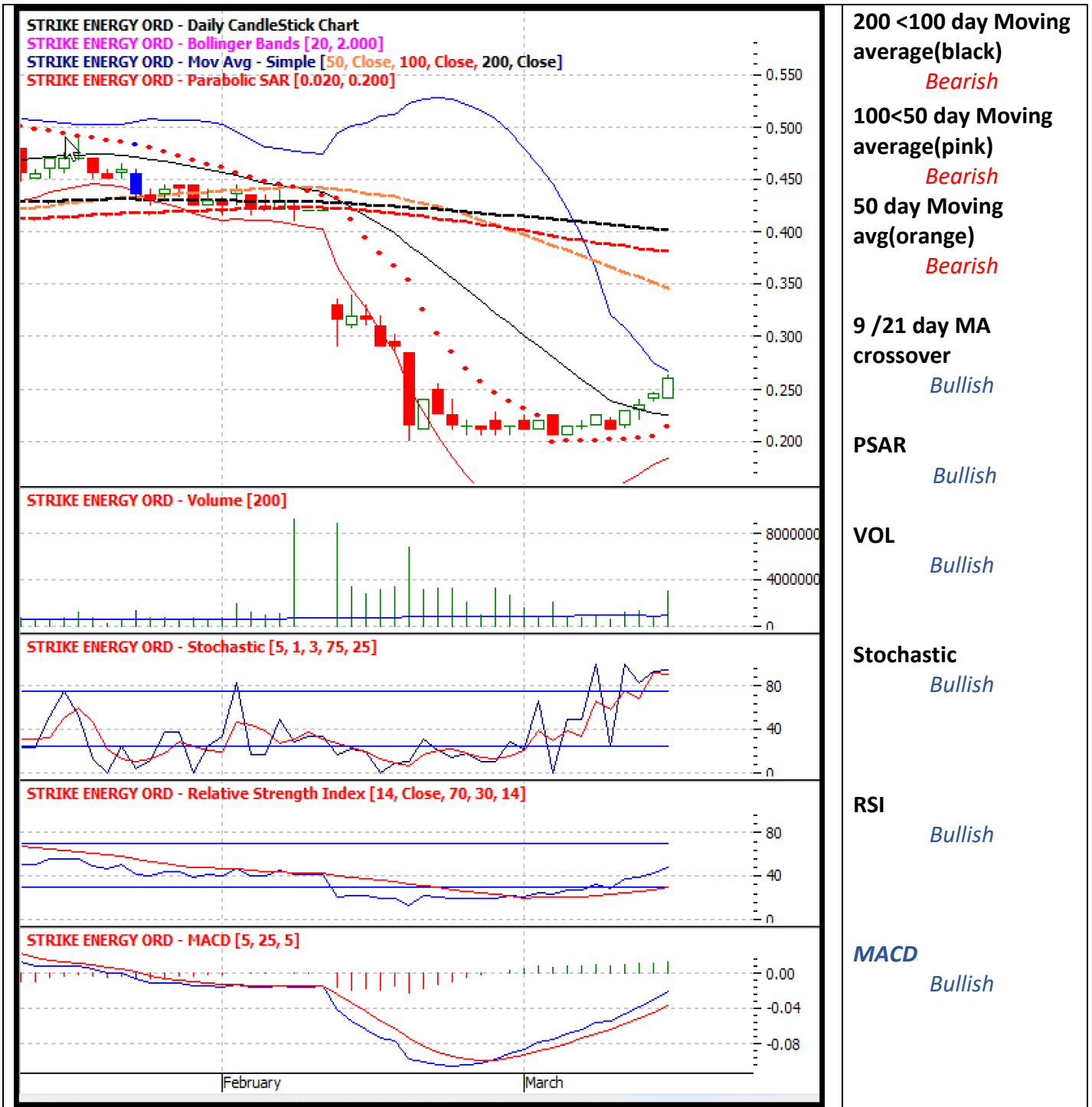
Chart Daily and indicators